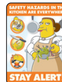
S1129 Kitchen Safety