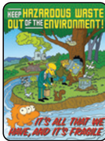
S1101 Environmental Safety