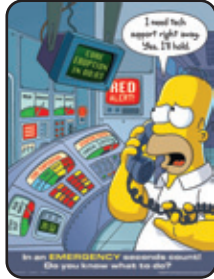
S1105 Emergency Preparedness