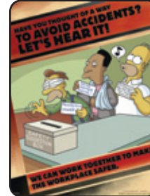
S1108 Accident Prevention