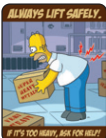
S1122 Lifting Safety