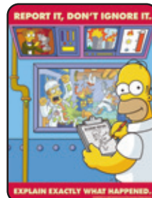
S1119 Accident Reporting