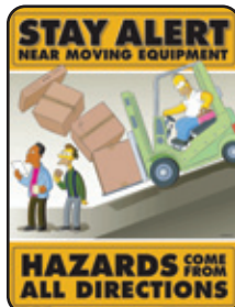
S1118 Forklift Safety