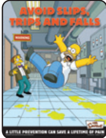
S1106 Slips, Trips & Falls