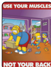
S1123 Back Safety