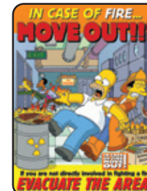
S1114 Move Out / Fire Safety