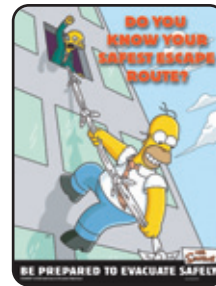
S1102 Emergency Evacuation