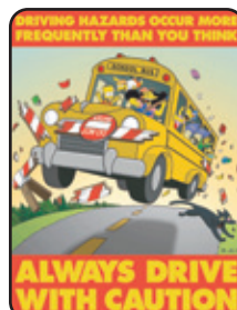
S1124 Driving Safety