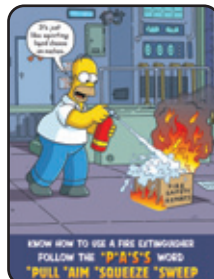
S1117 Fire Safety