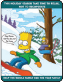
S1104 Off the Job Safety