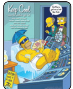
S1103 Heat Stress