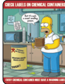
S1107 Chemical Safety