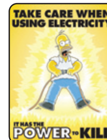
S1120 Electrical Safety