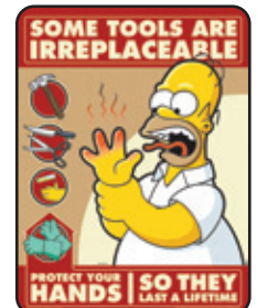
S1121 Hand Safety