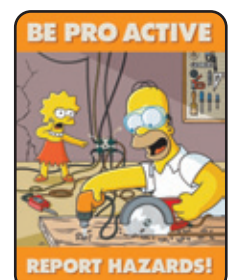
S1130 Hazard Identification