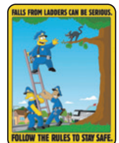
S1127 Ladder Safety