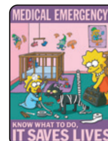
S1126 Medical Emergency