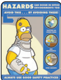
S1116 Office Safety