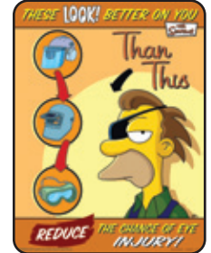
S1109 Eye & Face Safety