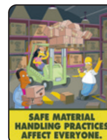
S1128 Warehouse Safety